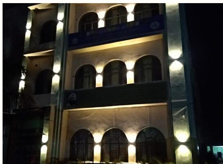
Well lit Campus