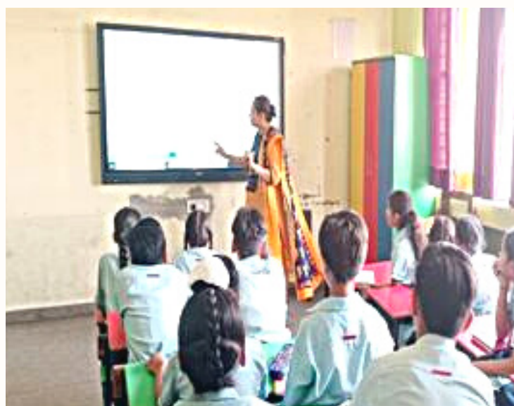
An EdTech-upgraded classroom