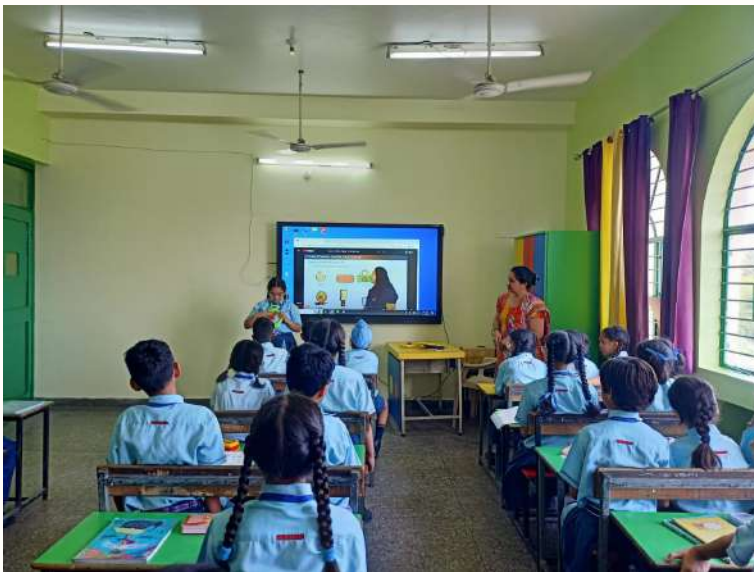
An EdTech-upgraded classroom