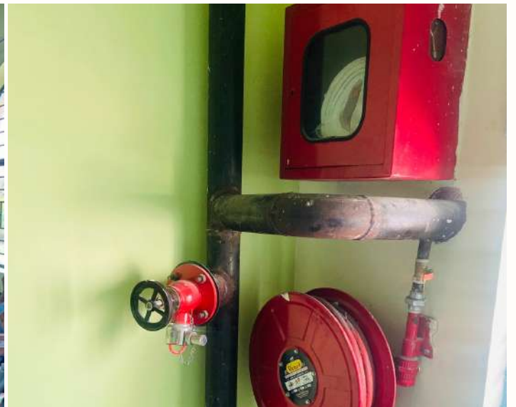
Installation of Hose reel